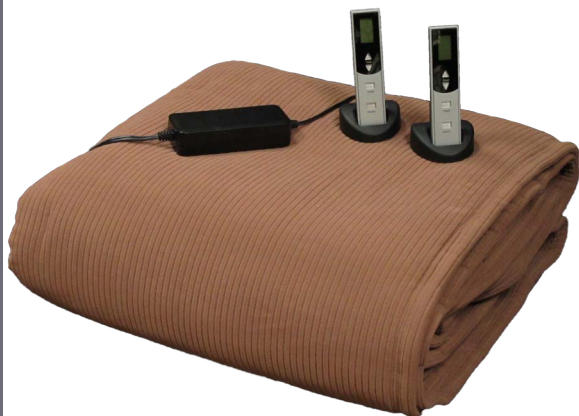
King size Infrared Blanket with dual remotes

With over 9 patents issued, and PCT worldwide patent filings for most countries, this unique line of infrared blankets can only be found at BioSmart or one of it's authorized dealers.