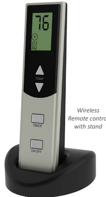
Wireless Remote control with stand