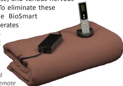
Full size Infrared Blanket with single remote

Since the 1970's growing concerns from dozens of studies have indicated that there is a correlation between the use of AC appliances, particularly electric blankets, and the risk for cancer, heart disease, and various nervous system disorders. To eliminate these kinds of risks, the BioSmart Infrared Blanket operates on bursts of low-voltage DC current and not AC.